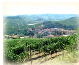
The beautiful Ricossa Vineyard